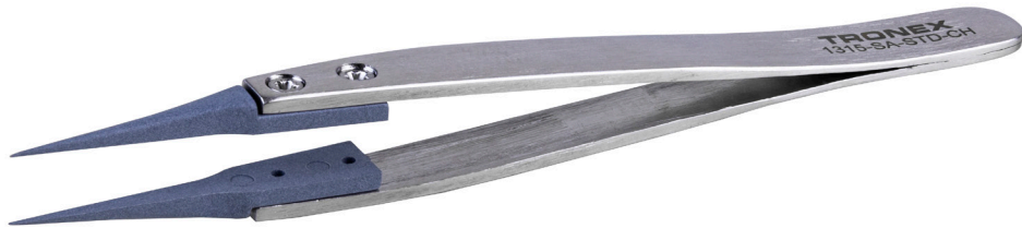
Replacement Tips Item: TIP-STD-15-CH