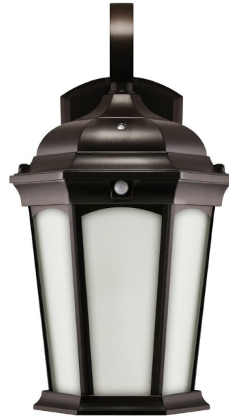
Integrated LED Fixture

*Note: Design, features and specifications subject to change without notice. Some features may not be available on all models. For more information please visit: www.eurilighting.com or call 1-888-743-5766