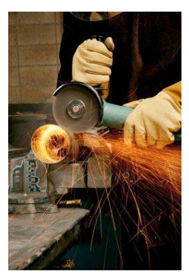
Specifically designed for use with 20,000 rpm Cut-Off Wheel Tool applications

Our 3M<sup>™</sup> Green Corps<sup>™</sup> Cut-off Wheel is a durable, fast-cutting wheel featuring high cut rates and a long life. Suitable for cutting nearly any material, including fiberglass, stainless steel, and mild steel. For use with utility type cut-off tools. DO NOT USE TOOLS WITHOUT GUARDS.