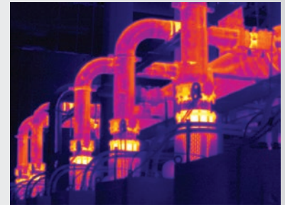
MultiSharp Focus, available on the Ti450.