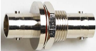
6744 BNC (F/F) Panel Mount Hermetically Sealed-75 Ω