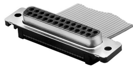
Receptacle- Low Profile Metal Shell