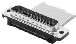
Plug- Low Profile Metal Shell