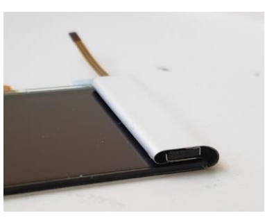
Properly rolled -03