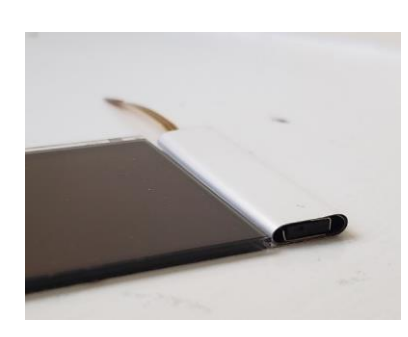
Properly rolled -01