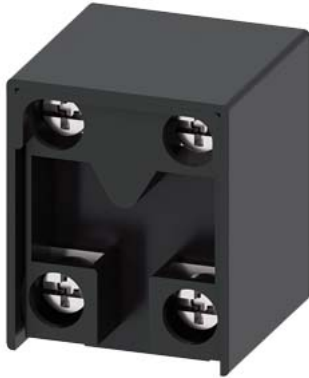
Contact block for position switch 3SE51/52 1 NO/1 NC slow-action contact