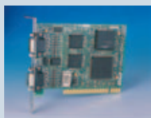
CC-525: PCI 2xRS422/485 18MBaud