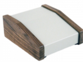
15 degree slope