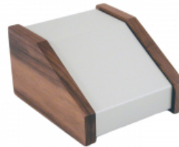
30 degree slope