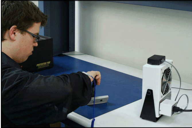
Figure 4. Using the Ionizer Motion Sensor with the 60505 High Output Benchtop Ionizer

Leave the sensor's field of view to activate the shutoff delay timer. The Ionizer Motion Sensor's LED will turn off and unpower the ionizer once the preset deactivation delay time is reached.