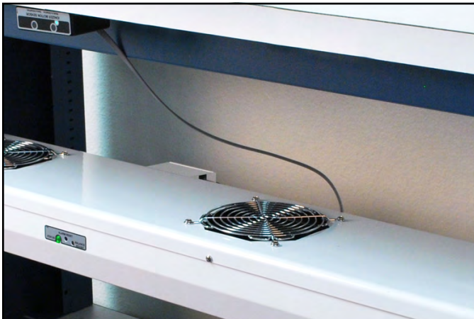
Figure 5. Using the Ionizer Motion Sensor with the 60473 Chargebuster® 3-Fan Overhead Ionizer