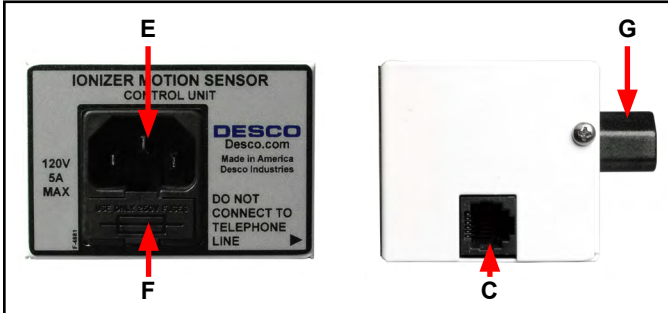
Figure 3. Control Unit features and components