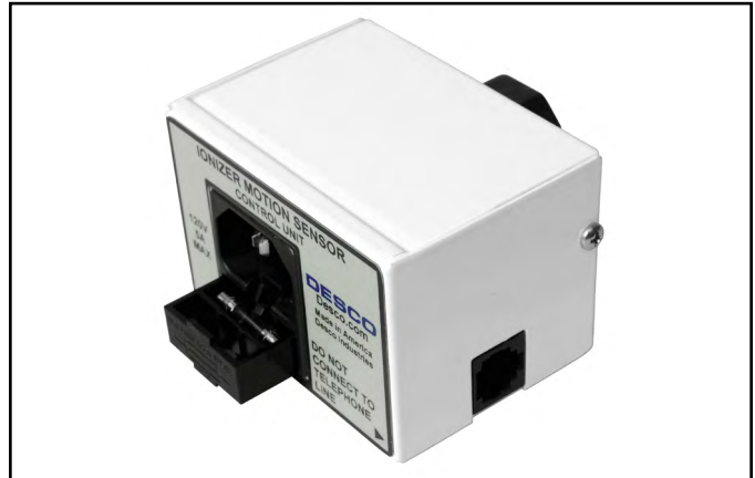
Figure 6. Replacing the fuse in the Control Unit

The fuse located in the Control Unit may be replaced by removing the power cord and opening the fuse drawer at the IEC inlet. The Control Unit uses one 5A, 250V slow blow fuse. DO NOT use other ratings as it may pose a safety hazard.