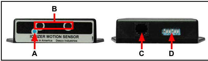
Figure 2. Sensor Unit features and components