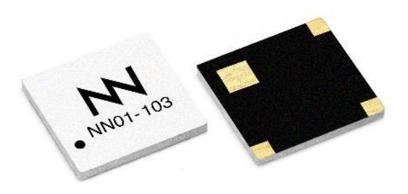
PAT US 7,148,850, US 7,202,822

10.0 mm x 10.0 mm x 0.9 mm (image larger than real size)