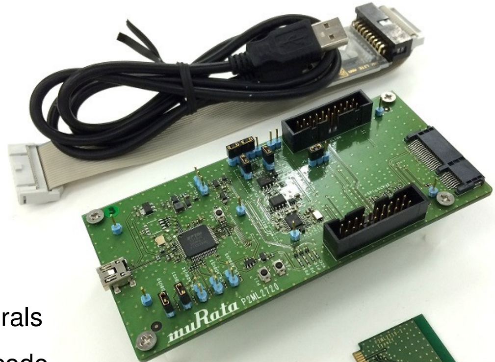
Design Kit Motherboard