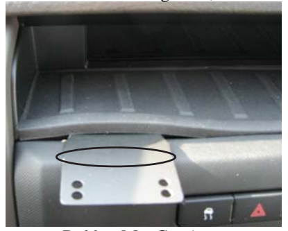
Rubber Mat Cut Area