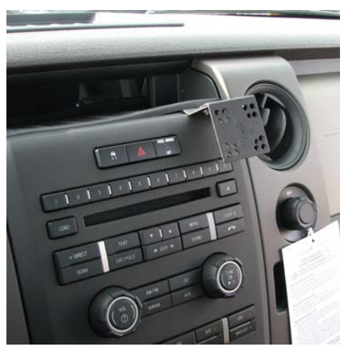
Mount in Place with Mounting Plate in Right Side Down Position