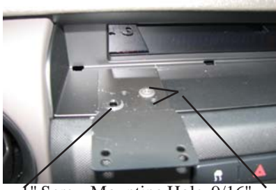
1" Screw Mounting Hole, 9/16'

Read instructions completely prior to starting installation. All InDash Mounts are designed so that after installation, phone is facing normal driver position for lefthand drive vehicles. This mount is not designed to be used in foreign countries with right-hand drive vehicles. Use extreme care when working around the plastic components on the dash. Excess force, can cause breakage of the plastic components.