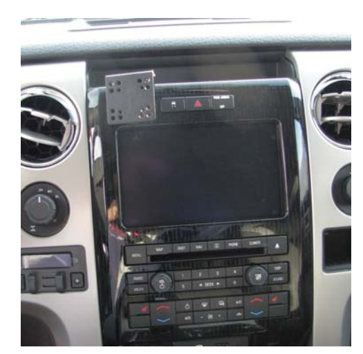
Mount in Place with Mounting Plate in Left Side Down Position on Nav.

INSTALLATION IS NOW COMPLETE. ENJOY YOUR NEW INDASH by PANAVISE MOUNT.