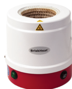
Without Control external control required