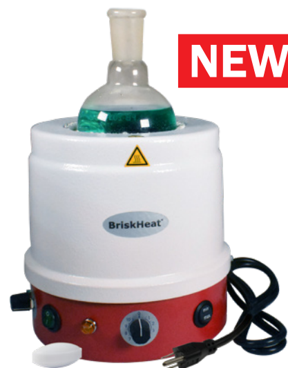
with Magnetic Stirrer and Control