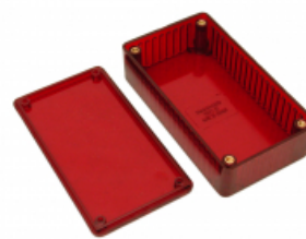
Available in transparent red