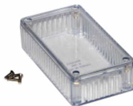
Available in clear