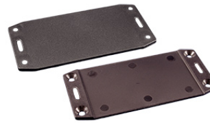
Accessory flanges available in black and gray