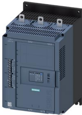
SIRIUS soft starter 200-600 V 143 A, 110-250 V AC Screw terminals Analog output