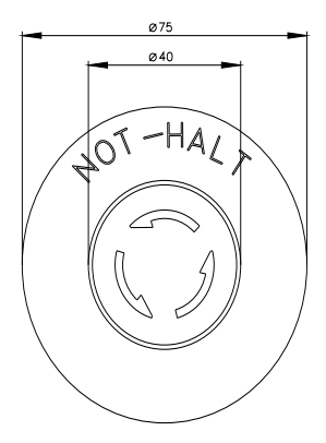
Image database (product images, 2D dimension drawings, 3D models, device circuit diagrams, EPLAN macros, ...) <a href="http://www.automation.siemens.com/bilddb/cax">http://www.automation.siemens.com/bilddb/cax</a> de.aspx?mlfb=3SU1150-1HB20-3FH0-Z X90&lang=en

https://support.industry.siemens.com/cs/ww/en/ps/3SU1150-1HB20-3FH0-Z X90