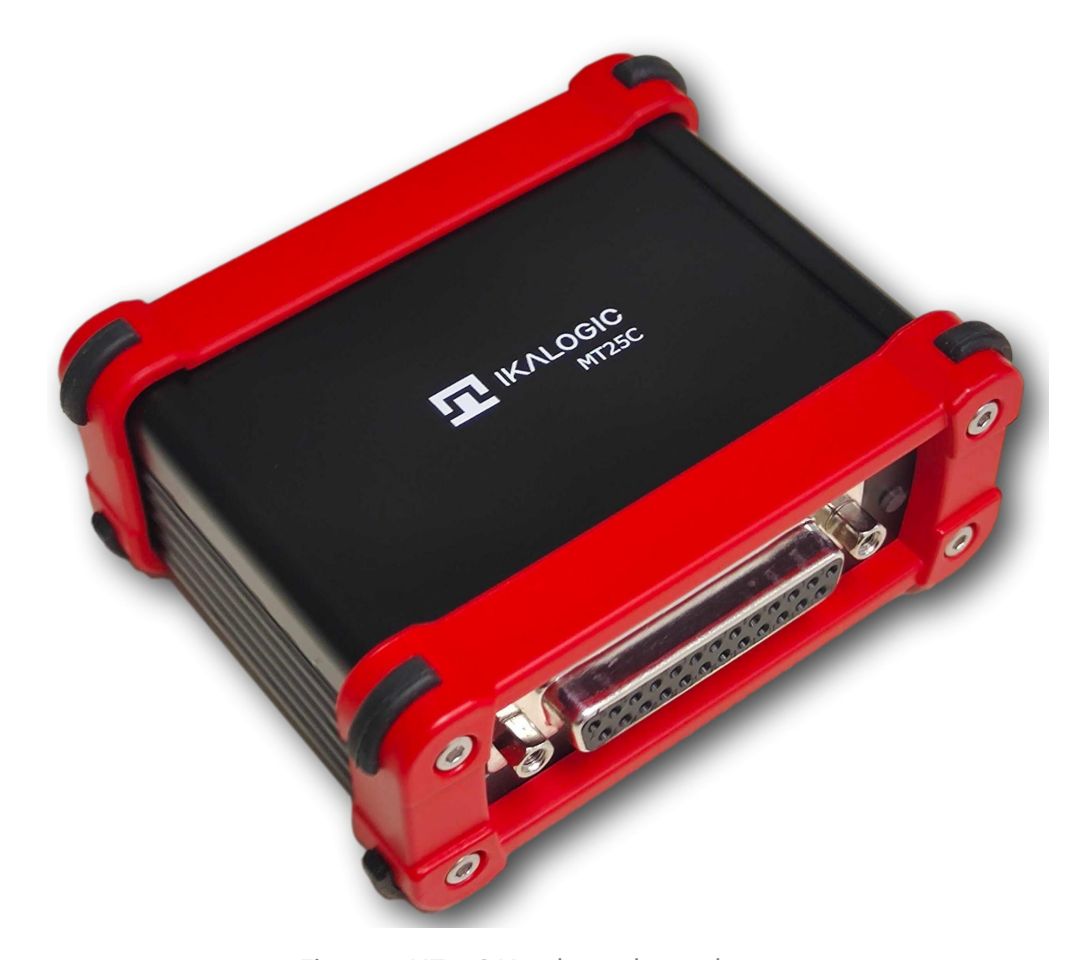
Figure 1: MT25C Membrane keypad tester

MT25C are optimized for industrial testing applications, and are highly configurable.