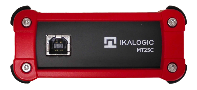
Figure 2: MT25C Back panel

MT25C devices connect to a host computer via USB port (type B) on the back panel as shown in the image below.