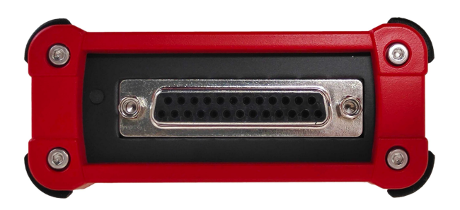
Figure 3: MT25C Front panel

On the front panel, a standard female DB25 port exposes the 25 test points as well as a status LED.