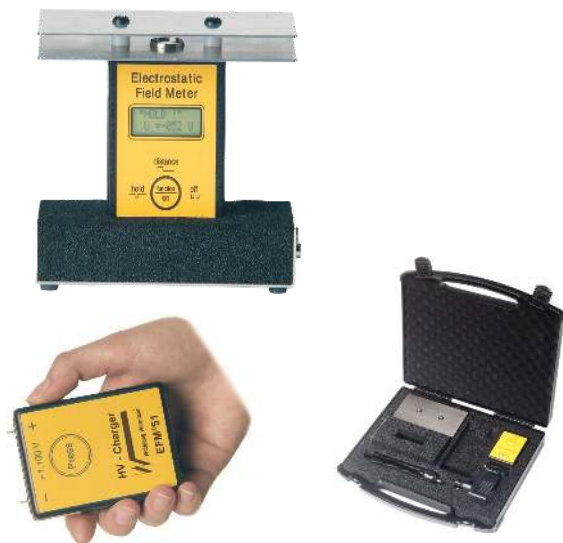
EFM51.CPS Charge Plate Kit

This document is prepared for our customers as a service, and is to the best of our knowledge true and accurate. However, it is understood and agreed by the users of this document that we will accept no liability for the conclusions reached. Users of this document may therefore wish to perform additional testing before determining that products mentioned are suitable.