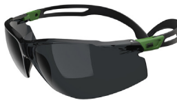
SF550AF-GRN 7100239205 Lens: IR 5.0 Gray, AF/AS Frame Color: Green & Black