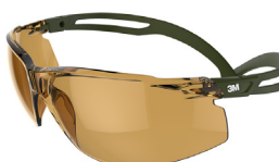
SF528SGAF-DGR 7100239088 Lens: Light Brown, SGAF/AS Frame Color: Olive Green