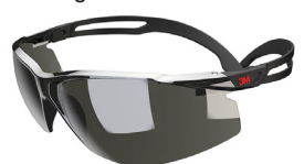
SF509AF-BLK 7100239203 Lens: Silver Mirror, SAF/AS Frame Color: Black