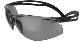
SF507AF-BLK 7100228721 Lens: Indoor/Outdoor Gray, AF/AS Frame Color: Black