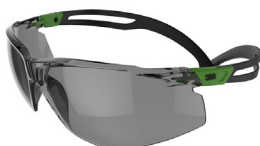
SF530AF-GRN 7100239086 Lens: IR 3.0 Gray, AF/AS Frame Color: Green & Black