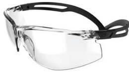
SF501AF-BLK 7100228736 Lens: Clear, AF/AS Frame Color: Black