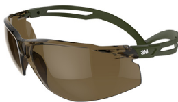
SF505SGAF-DGR 7100239191 Lens: Brown, SGAF/AS Frame Color: Olive Green