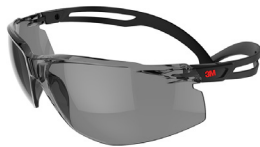
SF507SGAF-BLK 7100239091 Lens: Indoor/Outdoor Gray, SGAF/AS Frame Color: Black