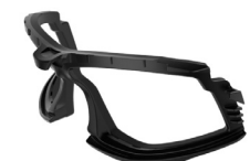
SF500-FOAM 7100239114 Foam Gasket Accessory

Give them a try—request a sample at 3M.com/SecureFit