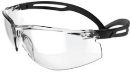
SF501AS-BLK 7100228758 Lens: Clear, AS Frame Color: Black