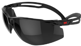
SF502SGAF-BLK 7100239089 Lens: Gray, SGAF/AS Frame Color: Black