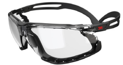
SF501SGAF-BLK-FM 7100238909 Lens: Clear w/Foam Gasket Frame Color: Black Coating: SGAF/AS