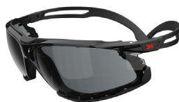
SF502SGAF-BLK-FM 7100239195 Lens: Gray w/Foam Gasket Frame Color: Black Coating: SGAF/AS