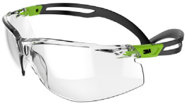
SF501SGAF-GRN 7100239087 Lens: Clear, SGAF/AS Frame Color: Green & Black