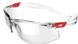
SF501SGAF-RED 7100239194 Lens: Clear, SGAF/AS Frame Color: Clear & Red