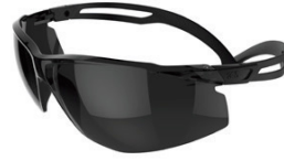
SF502AF-BLK 7100228722 Lens: Gray, AF/AS Frame Color: Black