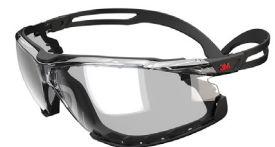
SF507SGAF-BLK-FM 7100239092 Lens: Indoor/Outdoor Gray w/Foam Gasket Frame Color: Black Coating: SGAF/AS