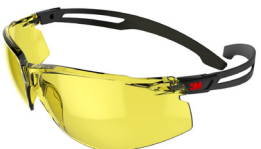
SF503SGAF-BLK 7100239090 Lens: Amber, SGAF/AS Frame Color: Black