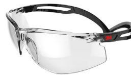
SF501SGAF-BLK 7100238910 Lens: Clear, SGAF/AS Frame Color: Black