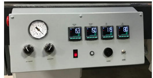
Easy-to-Use Operator Interface

Maximum Vacuum Pressure: 28.8 inHg (711 mmHg)