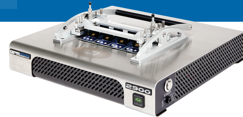
Production Programmer 2900L Universal Production Programming System with Integrated Lever Socket Actuator