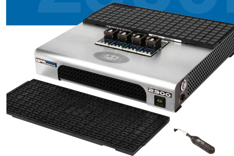
Production Programmer 2900 Universal Production Programming System