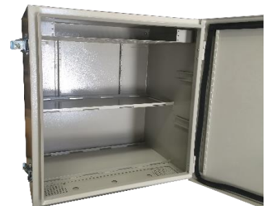
RPSTL Enclosure interior without batteries or controller