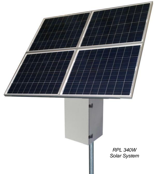
RPL 340W Solar System