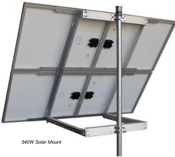
340W Solar Mount