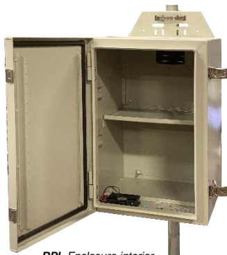
RPL Enclosure interior without batteries or controller