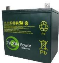
AGM 12V 52Ah Battery