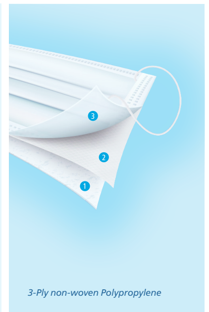
3-Ply non-woven Polypropylene