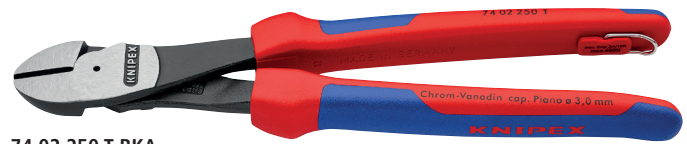
74 02 250 T BKA