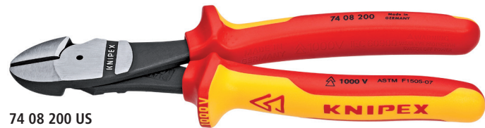
74 08 200 US