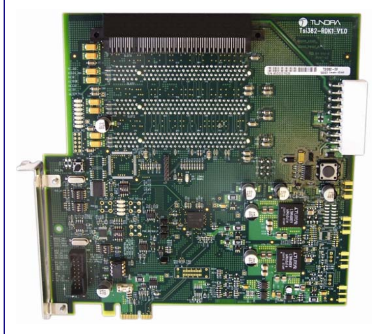
Figure 1 Tsi382 Evaluation Board

To evaluate the feature set of the Tsi382, IDT also offers an easy-touse Microsoft Windows based tool called "TsiView." This tool provides read and write access to an IDT "Tsi" PCIe device's register settings. In addition, it can be used to program an on-board, serial EEPROM device with register settings that have been optimized by TsiView.