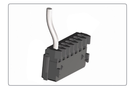
Unstripped wire inserted into MT housing.