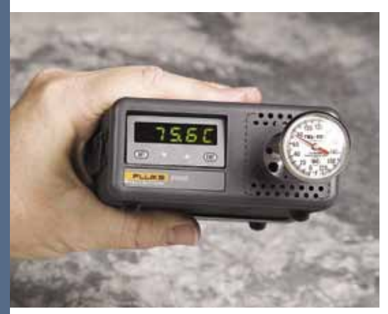
Temperature sensor calibration is easy with a handheld dry-well.