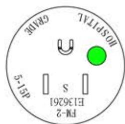
插頭端面圖 (Dimensions of Plug Face)

Insulation Thickness 0.76 mm Overall Diameter 2.70±0.10 mm