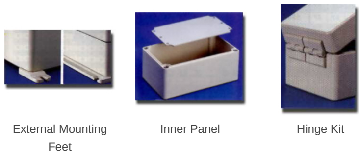
External Mounting Feet