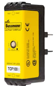
Indicating time-delay CUBEFuse.