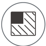
Compact & Superior Portability