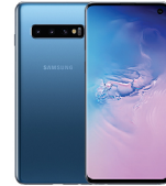
Samsung Galaxy S10