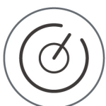
Auto On / Off