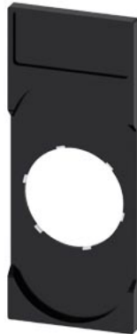
Label holder for twin pushbutton flat, black, for labeling plate 12.5 mm x 27 mm Z=100-unit packaging