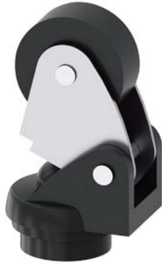
Actuator head for position switch 3SE51 Roller lever Stainless steel lever and Plastic roller 22 mm