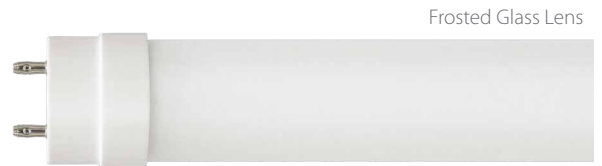
Frosted Glass Lens

LED ET8-3140T-14 delivers superior brightness, valuable energy savings and long lasting performance. EURI 4 ft. Bypass Ballast LED T8 lamps are ideal for offices, conference rooms, hotels, academic complexes, research buildings, medical facilities and commercial stores. Available in 4000K Bright White and 5000K Cool White . Enjoy features such as: instant on, shatter resistant, mercury free.