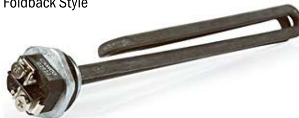
Heavy-duty foldback style*

* Resists dry firing, lime deposits, and sand that could cause burn-out to ordinary elements. Best when water has high mineral context. Minimum tank diameter 15"