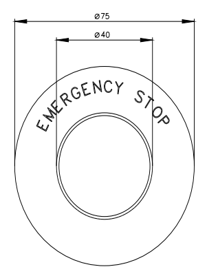
Image database (product images, 2D dimension drawings, 3D models, device circuit diagrams, EPLAN macros, ...) <a href="http://www.automation.siemens.com/bilddb/cax_de.aspx?mlfb=3SU1100-1HA20-1FG0-Z X90&lang=en">http://www.automation.siemens.com/bilddb/cax_de.aspx?mlfb=3SU1100-1HA20-1FG0-Z X90&lang=en</a>

https://support.industry.siemens.com/cs/ww/en/ps/3SU1100-1HA20-1FG0-Z X90