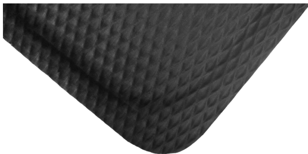
Hog Heaven with black border

Can be customized with your logo, design, or message (see Hog Heaven Impressions)