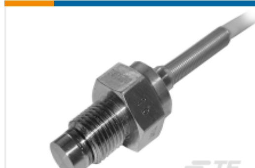
TE Part #EXPC1-200BS-C00003 XPC10-M-200BS