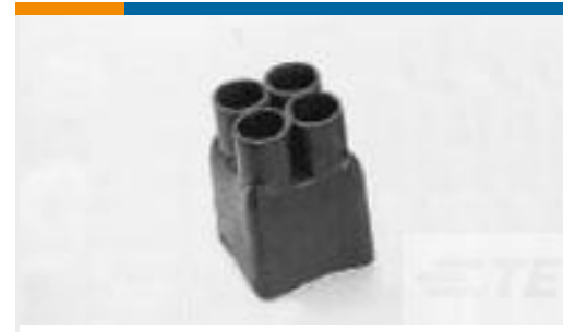
TE Part #034084-001 F133-200-FR