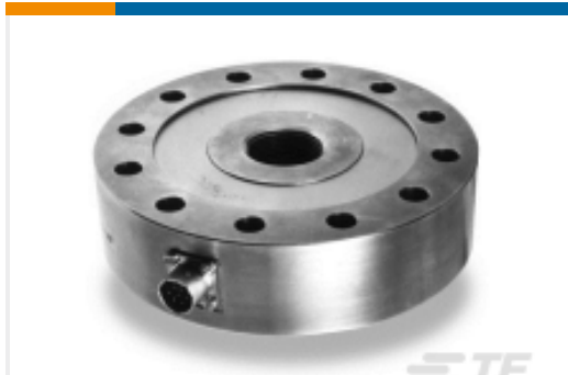
TE Part #20018780-00 Load Cell up to 200,000 Lb, FN3000