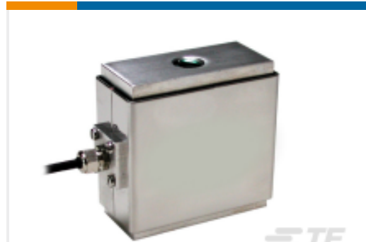
TE Part #EFN31-100N-C20005 FN3148-100N-/SC