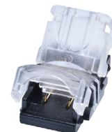
TAPE-TO-WIRE GRIPPER CONNECTOR