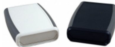
Light Grey or Black Enclosure Color