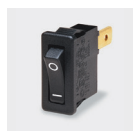
☐ X8800VA ☐ T8800VA - - -