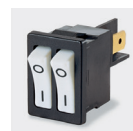
☐ H8800V/H8800VA ☐ T8800V/T8800VA