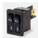
☐ H8800V/H8800VA ☐ T8800V/T8800VA