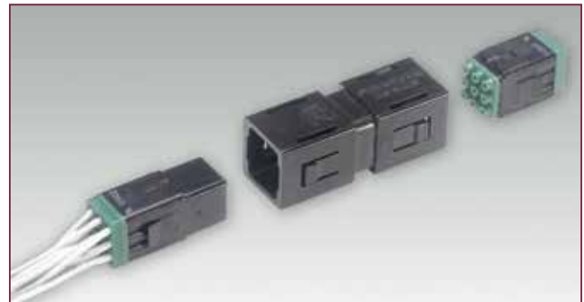
LMS Tool-less Splice Connector