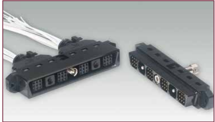
LMD Receptacle and Plug