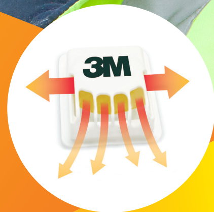
3M™ Cool Flow™ Valve

When performing physically demanding work, finding both reliable and comfortable respiratory protection is key to helping keep workers safe. With 3M disposable respirators there's a solution: 3M™ Cool Flow™ Valve technology.