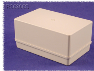
Assembled View (Bottom)