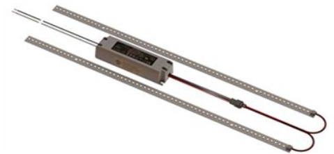
Converts 4 ft. and 8 ft. fixtures