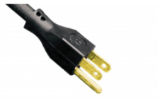
5-15P Straight Blade