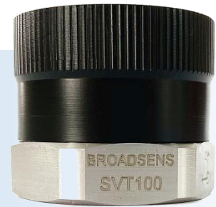
Wireless vibration & temperature sensor SVT100-A

SVT100-A is an ultra-low power wireless vibration and temperature sensor designed for machine condition monitoring. It has the advantages of easy installation, easy usage and high battery efficiency. SVT100-A consists of low power wireless IC, high performance 3-axis accelerometer and high precision temperature sensor. It can monitor the machine status in real time or by schedules. Multiple SVT100-As can be grouped together and divided into different groups at the wireless gateway (sold separately). They can be synchronized to provide advanced monitoring and analysis ability.