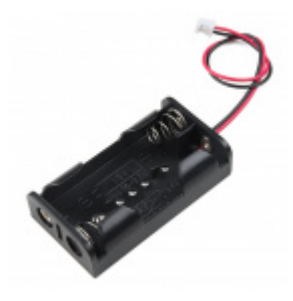
Battery Holder - 2xAA (JST-PH) • PRT-14299